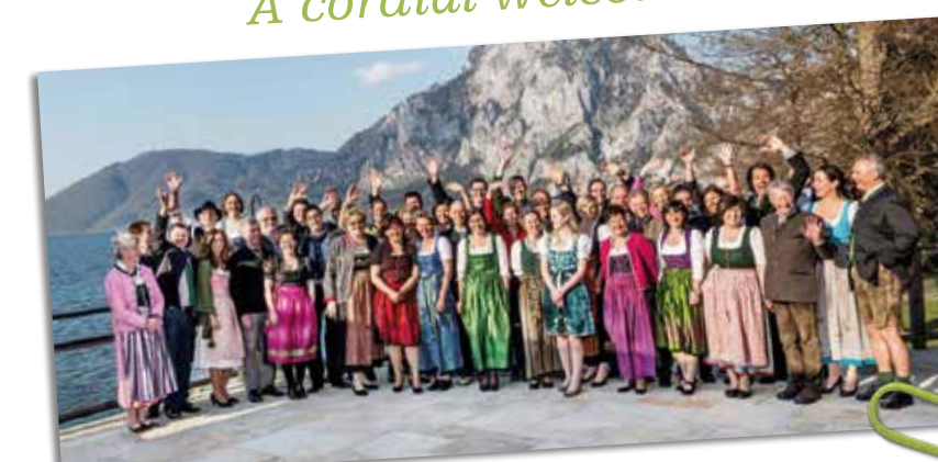
The LANDHOTELS Family